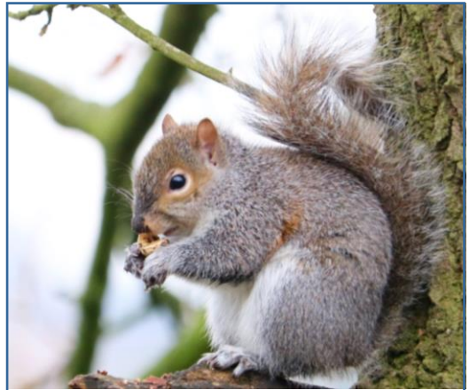
2. Grey Squirrel