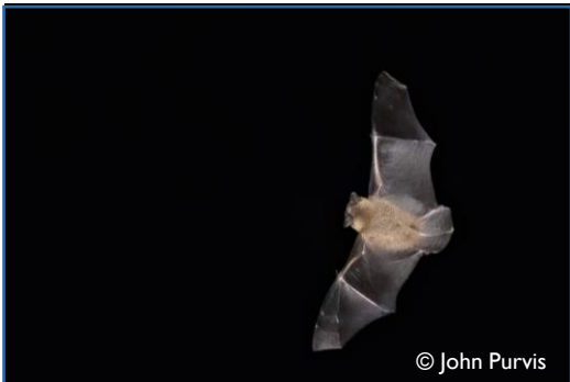
3. Pipistrelle Bat