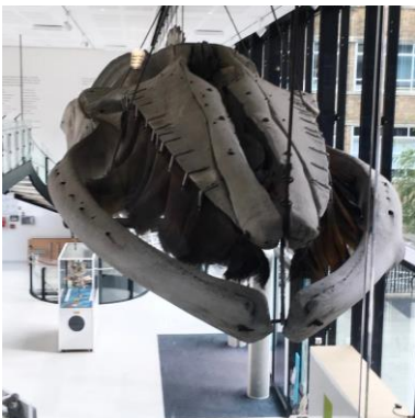
Fin whale: BOTH

Fin whales are found in oceans across the world, but more often in temperate and polar waters than around the tropics.