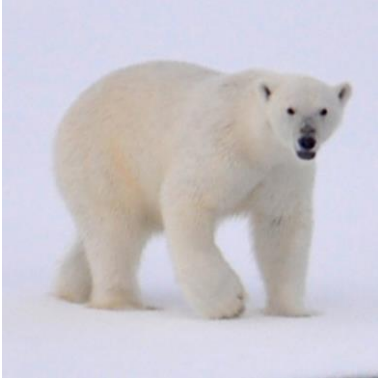
Polar bear: ARCTIC