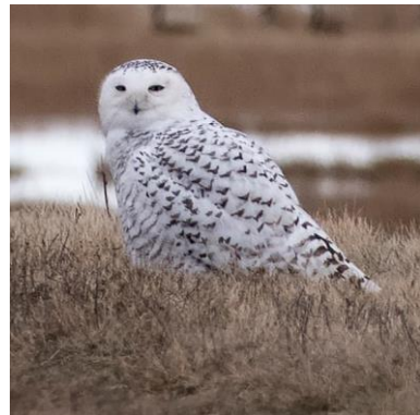
Snowy owl: ARCTIC