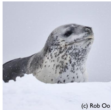
Leopard seal: ANTARCTIC

Fin whales are found in oceans across the world, but more often in temperate and polar waters than around the tropics.